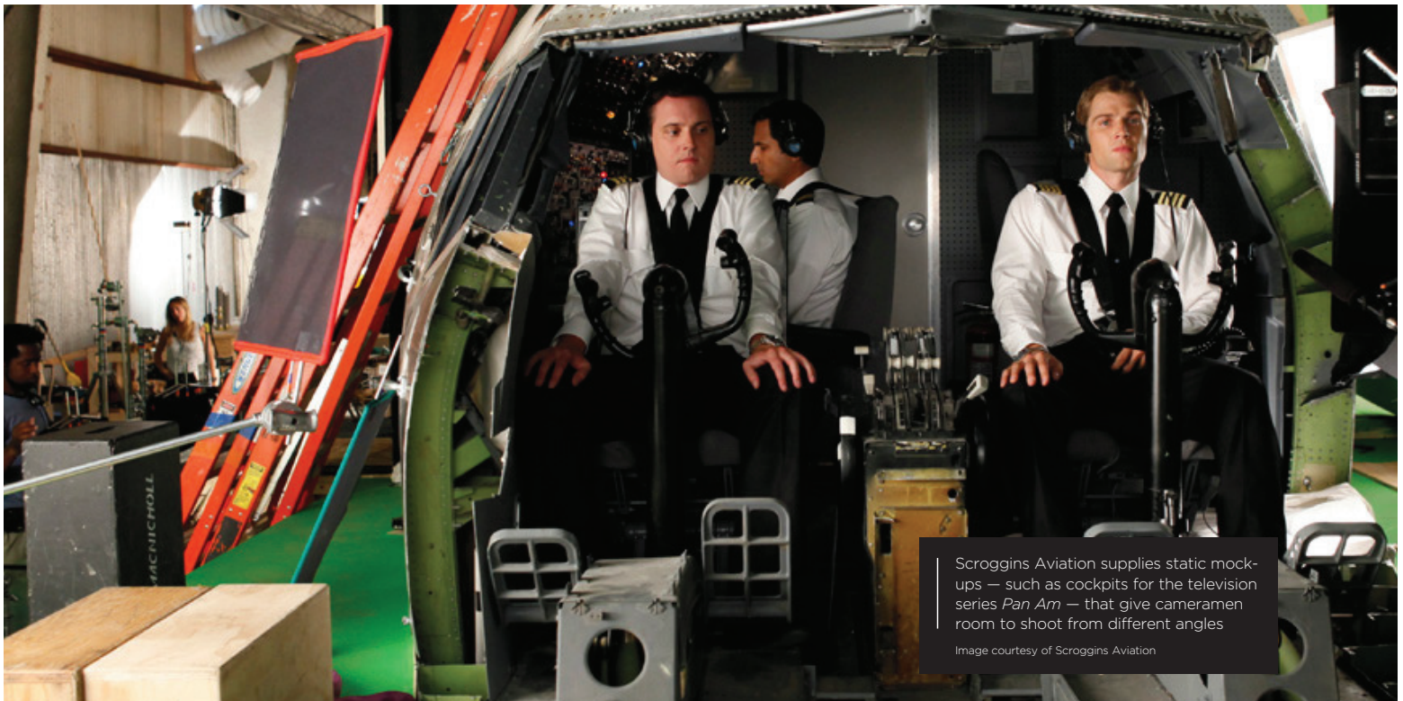
Scroggins Aviation supplies static mock-ups — such as cockpits for the television series Pan Am — that give cameramen room to shoot from different angles