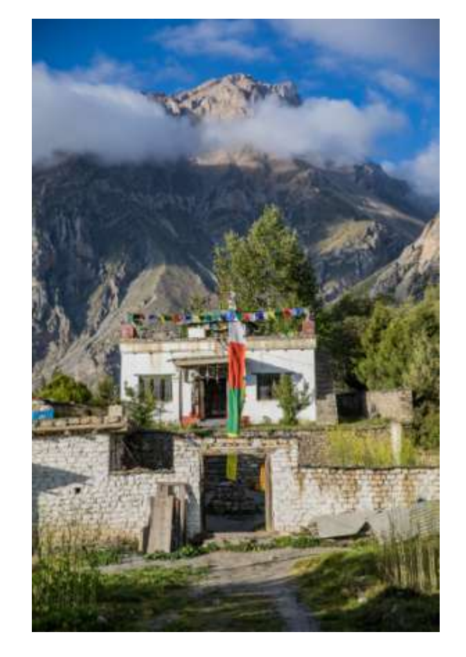
Day 05: Drive to Lumbini (3 hrs drive/138 km)

After breakfast, you'll experience a full day of safari activities in Chitwan National Park. If you're lucky, you will see many of the amazing creatures Chitwan is famous for, including rhinoceroses, Chitwan's royal Bengal tigers, leopards, monkeys, many types of deer and reptiles. Your safari excursion includes a jungle safari, canoeing and bird watching. You'll definitely want to have your camera close by.