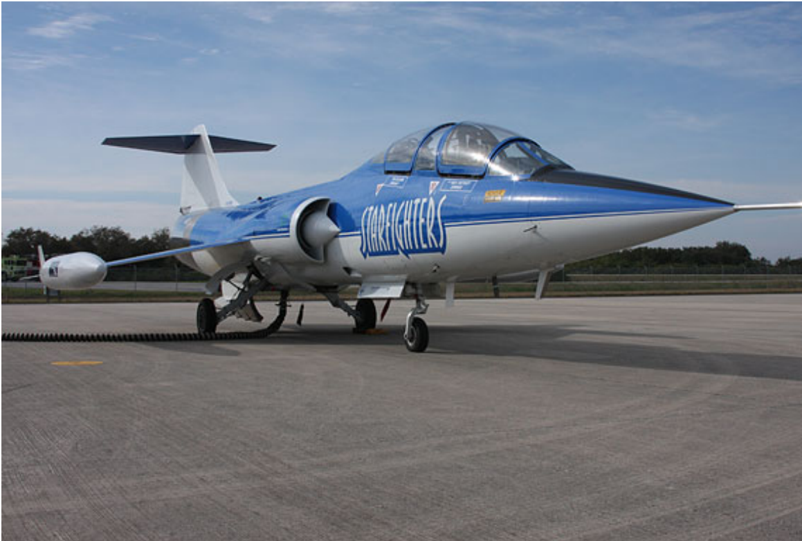
Caption: SwRI researchers and suborbital payload specialists are undergoing flight training aboard F-104 aircraft operated by Starfighters Inc.