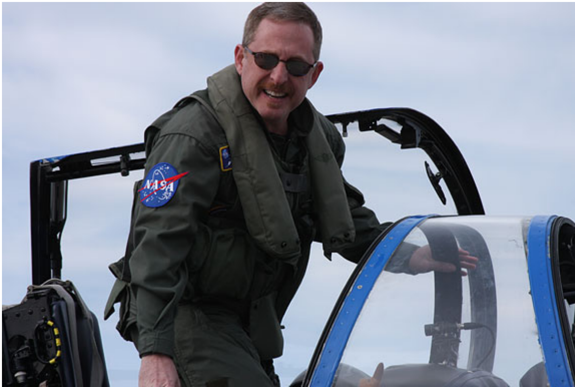
Caption: Dr. Alan Stern, Associate Vice President, Space Science and Engineering Division, Southwest Research Institute